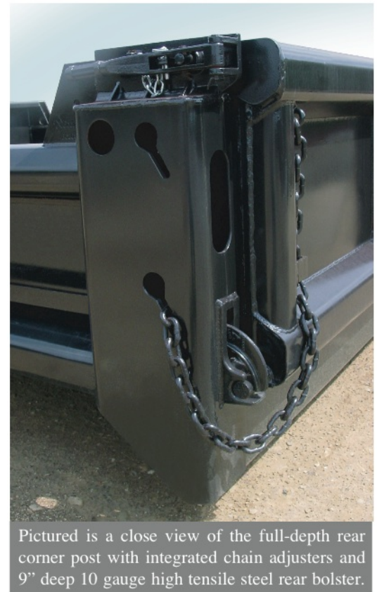
Pictured is a close view of the full-depth rear corner post with integrated chain adjusters and 9" deep 10 gauge high tensile steel rear bolster.

Galion-Godwin Truck Body Co. LLC. 7415 Peabody-Kent Rd. Winesburg OH. 44690 P.O. Box 208 (877) 450- 4794 Fax (330) 359-5660