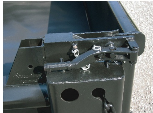
Pictured is a close view of the upper quick release hardware of the standard 100U body. This hardware makes it easy to quickly remove and reinstall the tailgate as needed

FULL FACTORY WARRANTY complete parts and service available through nationwide authorized distributors